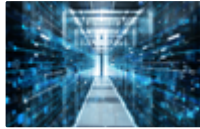
Move-in Tech Set-up Service