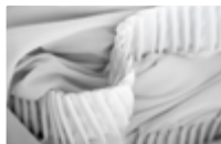
Curtain Cleaning & Cleaning Services