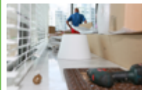
Handyman, Electrical, Plumbing, Air-con & Carpentry Services

Ask us to find out more about our PLATINUM CONCIERGE SERVICE!