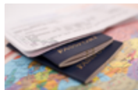
Visa & Immigration Assistance